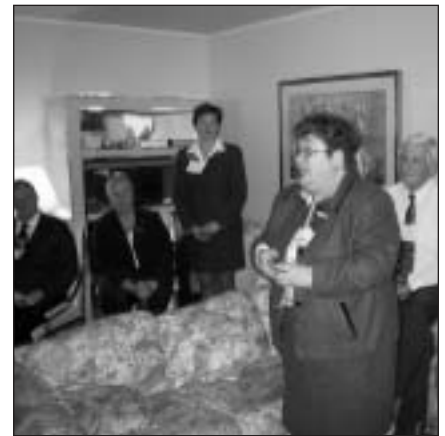
Minister of Municipal Affairs, Cathy McGregor, addressing the municipal delegates.