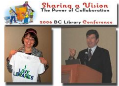
At the April 2006 BCLA/BCLTA Conference - Minister Shirley Bond and Glen Murray (keynote speaker)